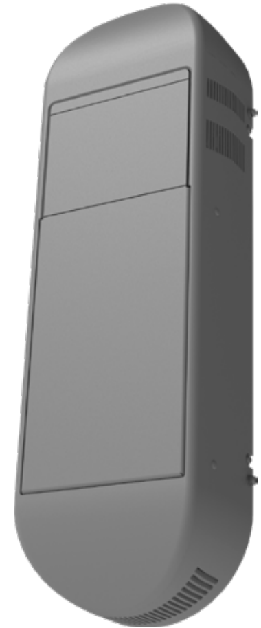
Mount to existing vertical infrastructure